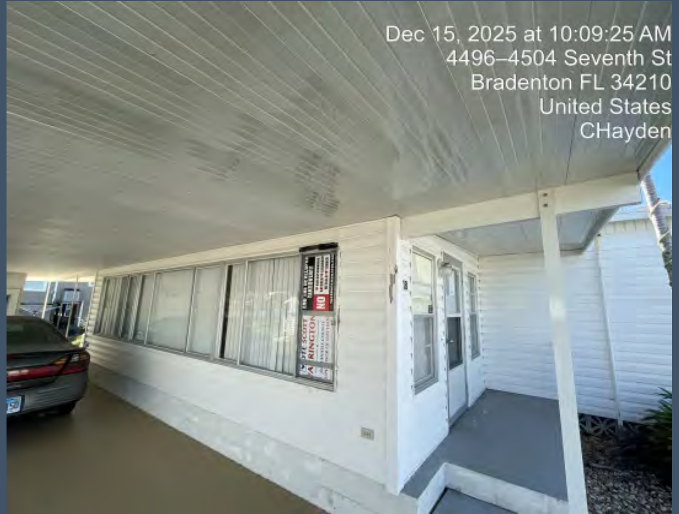
View from the carport

Dec 15, 2025 at 10:09:25 AM 4496-4504 Seventh St Bradenton FL 34210 United States CHayden